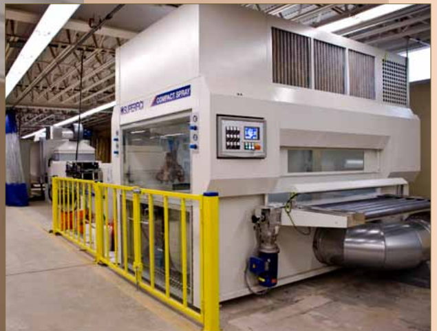
Compact Spray Machine