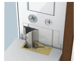
The Multi-Point features patent pending lock pawls activated by the deadbolt to engage keepers in the active door, providing three locking points. No deflection.

Endura's Multipoint Astragal combines the strength and support of a multi-point lock with Endura's Ultimate Astragal to provide: